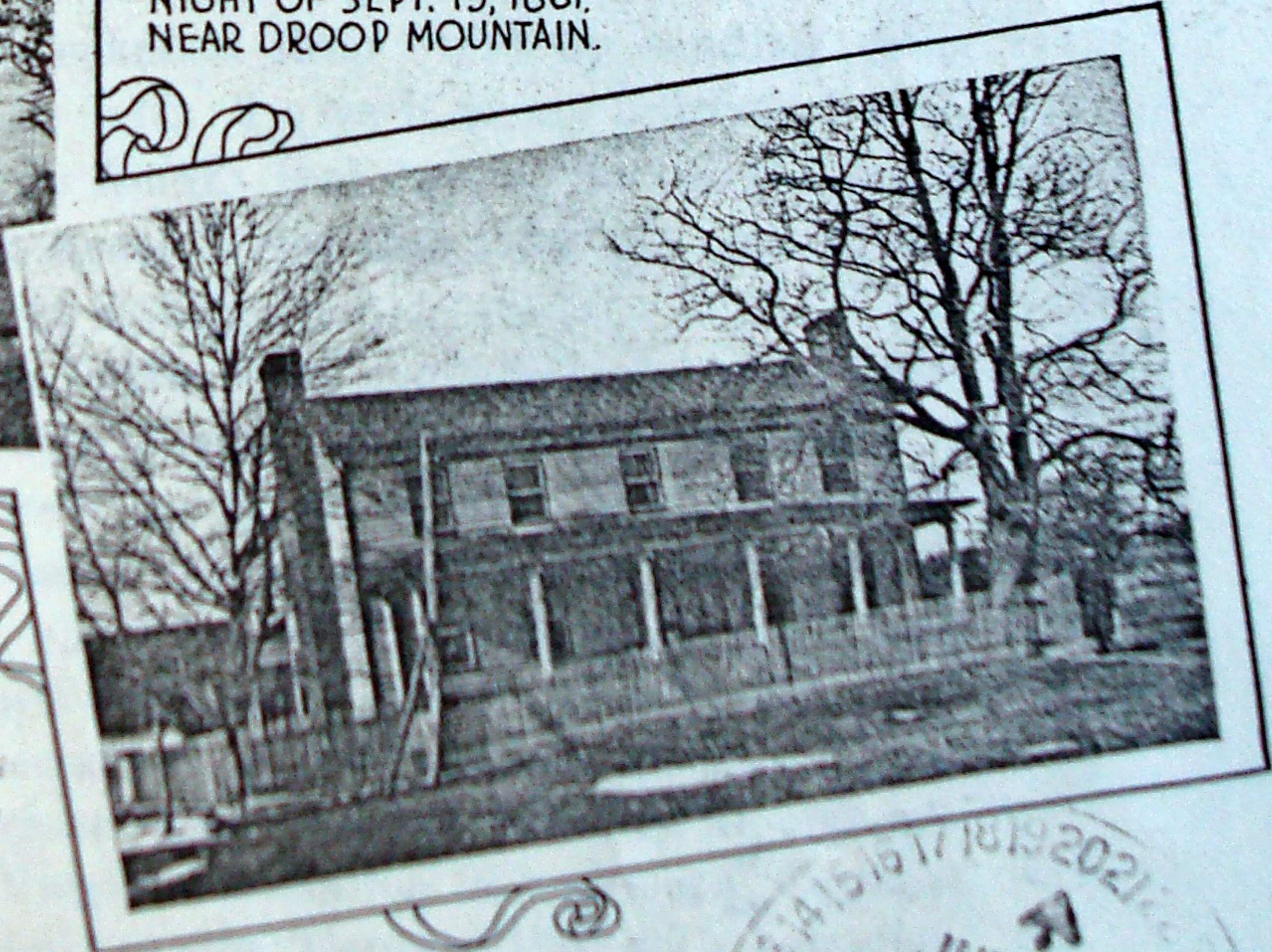
AVERELL'S HOSPITAL- BEARD'S RESIDENCE AT HILLSBORO.